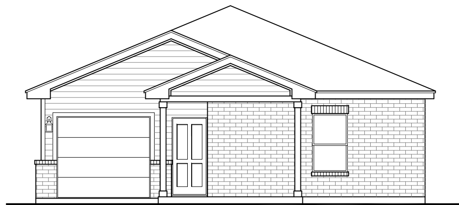
FRONT ELEVATION - B