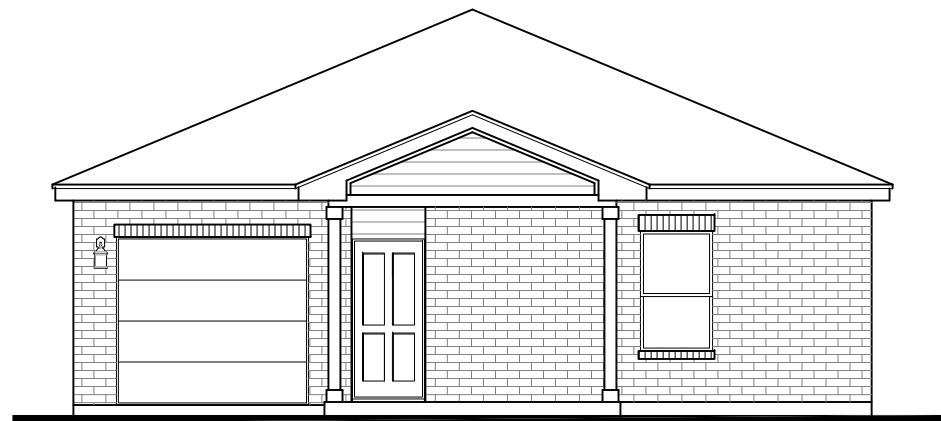
FRONT ELEVATION - A